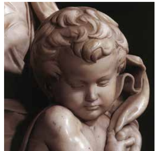
Madonna and Child detail, by Michelangelo, Bruges