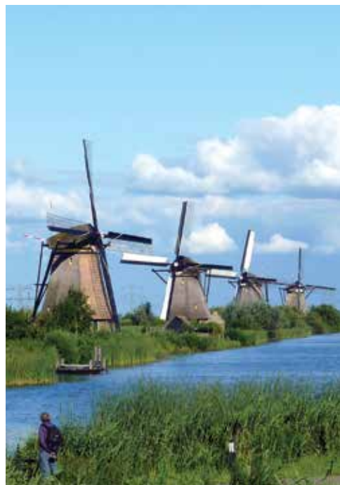
Windmills in Kinderdijk