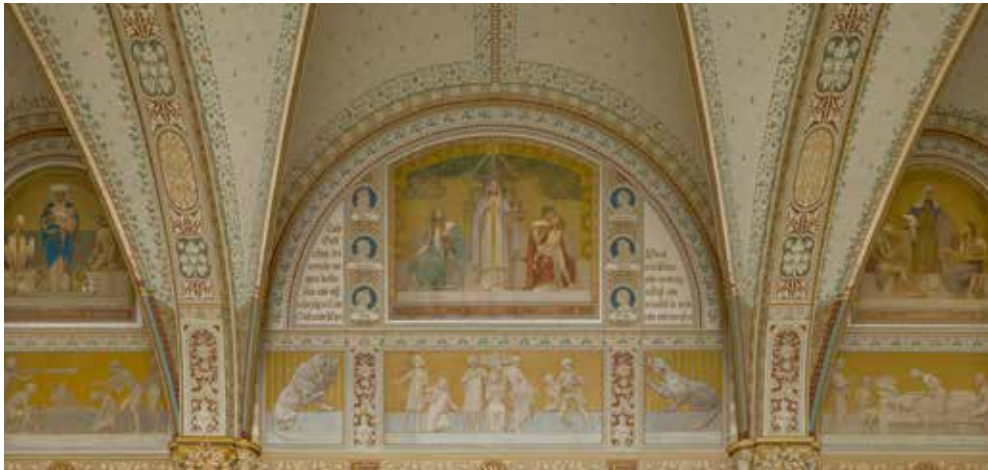
The Rijksmuseum, Amsterdam