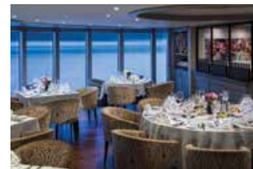
Chef's Table restaurant