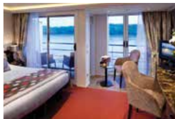
Twin Balcony Stateroom

International airfare; passport fees; alcoholic beverages other than wine and beer at lunches and dinners; personal items and expenses; airport transfers for those not on suggested flights; baggage in excess of one suitcase; trip insurance; optional prelude in Amsterdam; optional postlude in The Hague; any other items not specifically mentioned as included.