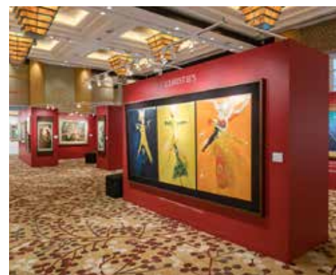
Christie's Hong Kong

Spend the morning at the West Kowloon Cultural District, an ambitious harbor-front arts and culture hub that is still under development. We are then invited for lunch at the exclusive China Club, followed by a special viewing of contemporary art at Christie's, Hong Kong. Spend the remainder of the afternoon exploring the exhibitions at Art Basel. Dinner is at leisure. B, L