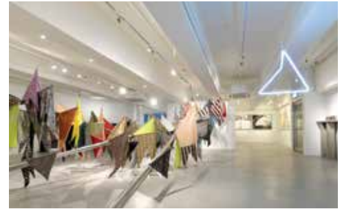
Sheela Gowda's Solo Exhibition, Para Site, Hong Kong

This itinerary is subject to change at the discretion of The Metropolitan Museum of Art and Arrangements Abroad. For complete details, please carefully read the terms and conditions at www.arrangementsabroad.com/terms .