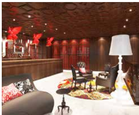
Mira Moon Hong Kong

In the heart of bustling Causeway Bay on Hong Kong Island, Mira Moon is an award-winning boutique hotel reinterpreting Chinese Mid-Autumn Festival mythology through its interiors. Its 90 unique guestrooms offer complimentary Wi-Fi, HD LED IPTV, iPad minis, Bluetooth music systems, Nespresso coffee machines, and laptop-sized safes. There is a variety of restaurants on site, including the signature Tapas & Cocktail Bar serving all-day dining, and the Secret Garden on the terrace, for al fresco dining and evening drinks.