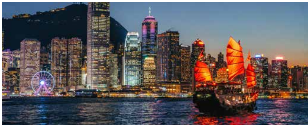
Hong Kong skyline