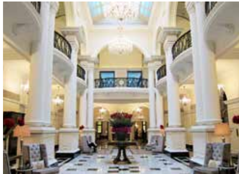
Waldorf Astoria Shanghai on the Bund

Located on the west bank of the Huangpu River, the Waldorf Astoria Shanghai on the Bund offers 260 guest rooms and suites occupying both a historical landmark building and a new one of contemporary design. There are six on-property restaurants and lounges.