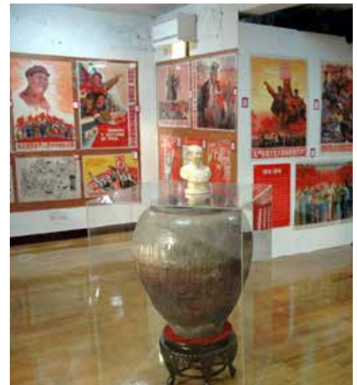
Photos clockwise from top right: regional map; Humble Administrator's Garden; Propaganda Poster Art Museum, Shanghai; Suzhou Museum; Tai Chi on the Bund, Shanghai; Mixed Media Sculpture Installation by Aaron Curry, Art Basel Hong Kong. Front cover: The Kangxi Emperor's Southern Inspection Tour, Scroll Three: Ji'nan to Mount Tai , Qing dynasty (1644–1911). Wang Hui (Chinese, 1632–1717) and assistants. Handscroll; ink and color on silk. The Metropolitan Museum of Art, Purchase, The Dillon Fund Gift, 1979 [1979.5a–d]. Back cover: Power Station of Art, Shanghai (top); Shanghai skyline (bottom).