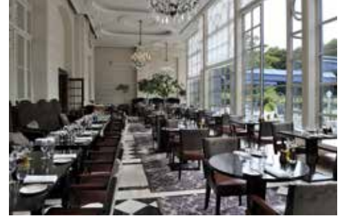
Trianon Palace Versailles, Veranda Restaurant