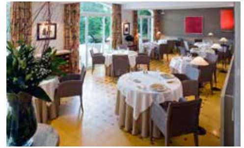
The Domaine de la Tortinière restaurant