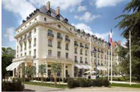
Trianon Palace Versailles

Only 30 minutes from Paris, this luxury country retreat is within walking distance of the legendary Château de Versailles. The hotel offers a range of rooms and suites. Dining options at the Trianon Palace include The Michelin-starred Gordon Ramsay au Trianon. The hotel also has a luxurious spa and fitness facilities.