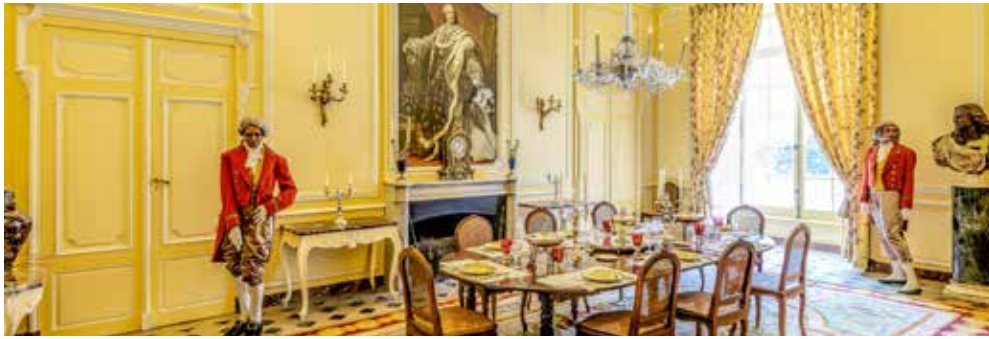
Château d'Ussé