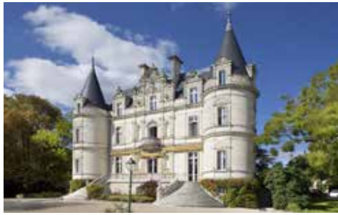
The Domaine de la Tortinière

The Domaine de la Tortinière is a beautiful 4-star hotel at the heart of the Loire châteaux region. Set in a magnificent wooded park that overlooks the Loire Valley, the hotel boasts many amenities including the château's terrace, tennis court, heated swimming pool, billiard room, massage room and sauna, and boats for drifting along the Indre River.