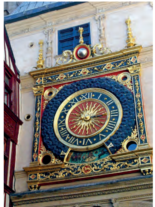
Photos clockwise from top: Map of the region; American Memorial at Omaha Beach; Astrological clock, Rouen, The Seine in Les Andelys; Musée de l'Orangerie, Paris; and the ruins of Jumièges Abbey. Front cover: Garden at Sainte-Adresse. Claude Monet (French, Paris 1840–1926 Giverny). Paintings. Purchase, special contributions and funds given or bequeathed by friends of the Museum, 1967. (67.241). Back cover photos: Giverny by Claude Monet. (French, Paris 1840-1926 Giverny), oil on canvas, The Metropolitan Museum of Art, (29.100.113), (top); and Château de Chantilly (bottom).