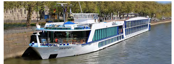
Main lounge (top left); stateroom (top right); and AmaLyra (above).

Introduced in 2009, the 148-passenger AmaLyra quickly earned a "Best New River Cruise Ship" distinction for comfort and style. Stateroom amenities include Entertainment-On-Demand, featuring free high-speed Internet access, unlimited Wi-Fi, movies, music, and English-language TV stations; climate-controlled air conditioning; and an in-room safe. Additional comforts and conveniences include a sauna, whirlpool, massage and hair salon, a stylish lounge, and specialty coffee station. With a walking track on the Sun Deck, a fitness room and a fleet of onboard bicycles, as well as healthy menu choices, you'll have all you need to stay active and healthy while sailing one of Europe's great rivers.