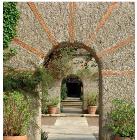
Bois des Moutiers