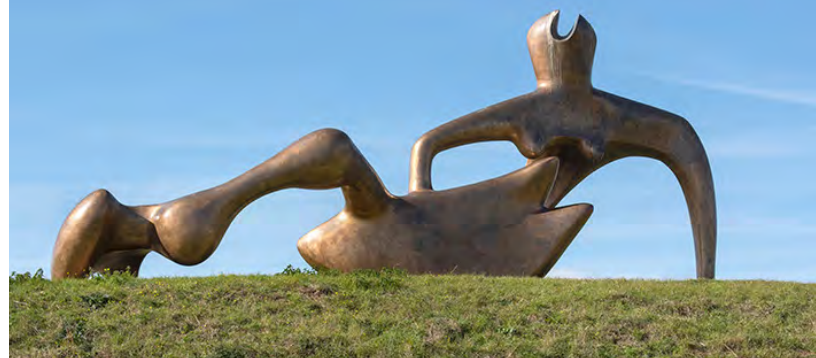
Henry Moore, Reclining Man , Henry Moore Studios & Gardens, Much Hadham

Depart London for an excursion to the village of Much Hadham, where you will tour Henry Moore Studios & Gardens, the home and workplace of the renowned 20th-century sculptor. Meander through 70 acres of gardens and admire Moore's monumental sculptures, which were placed as per his intentions within the landscapes. Immerse yourself in Moore's creative process with an intimate look at his six studios. Enjoy a private exploration of the 16th-century Aisled Barn, the only place in the world to see Moore's unique tapestries. Savor lunch nearby before returning to London in the afternoon. Later, enjoy a private visit at the the Honourable Society of the Middle Temple, one of London's four ancient law courts. Walk down cobbled lanes lit by gas lamps, and experience this 16th-century complex, which remains virtually unchanged to this day. Step into one of the finest Elizabethan halls in the country where generations of royalty have dined. Visit the Temple Church, built by the Knights Templar. Consecrated in 1185, it is among the oldest and most beautiful churches in London. Return to the Middle Temple for dinner in its elegant Queen's Room. B,L,D