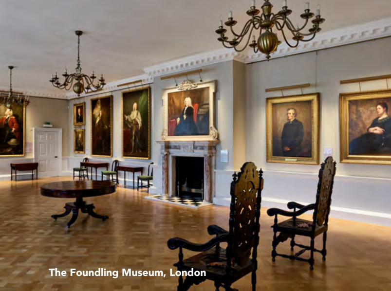
The Foundling Museum, London