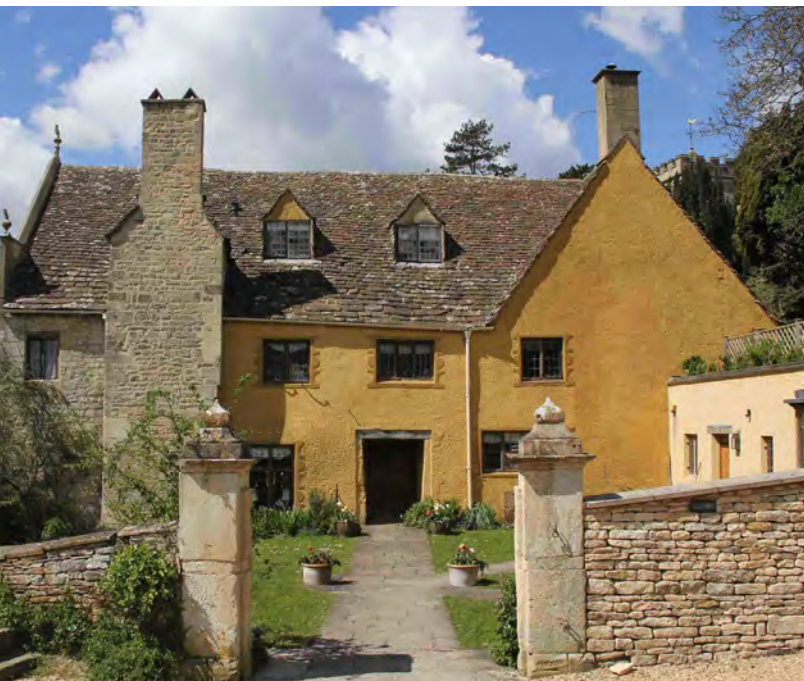
Owlpen Manor, The Cotswolds

DISCLAIMER: The itinerary is subject to change at the discretion of the Museum Travel Alliance. For complete details, please carefully read the terms and conditions at https://museumtravelalliance.com/faq.php