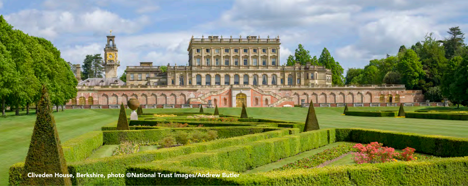
Cliveden House, Berkshire