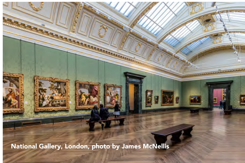
National Gallery, London

held curatorial positions at the Missouri History Museum and the Art Institute of Chicago, and he received his doctorate in Art History from the University of Pennsylvania.