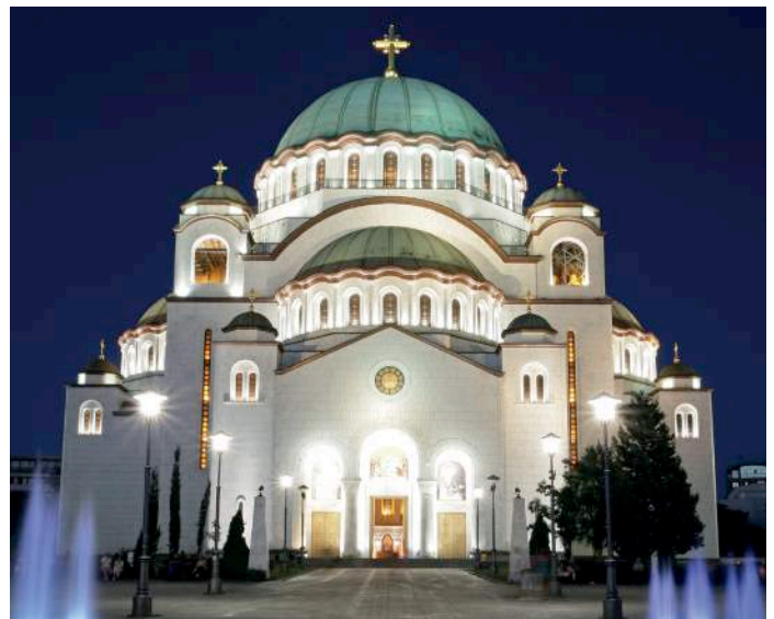
Domes of St. Sava, Belgrade

Arrive this morning in Bratislava, situated in the foothills of the Carpathian Mountains. Drive by Pálffy Palace, where a six-year-old Mozart gave a concert, and see the stunningly restored Mirbach Palace during a walking tour. There will be time to browse in the tempting crafts shops before returning to the ship for lunch and an afternoon cruise to Budapest. Gather for a lecture at teatime. Dinner is on board.