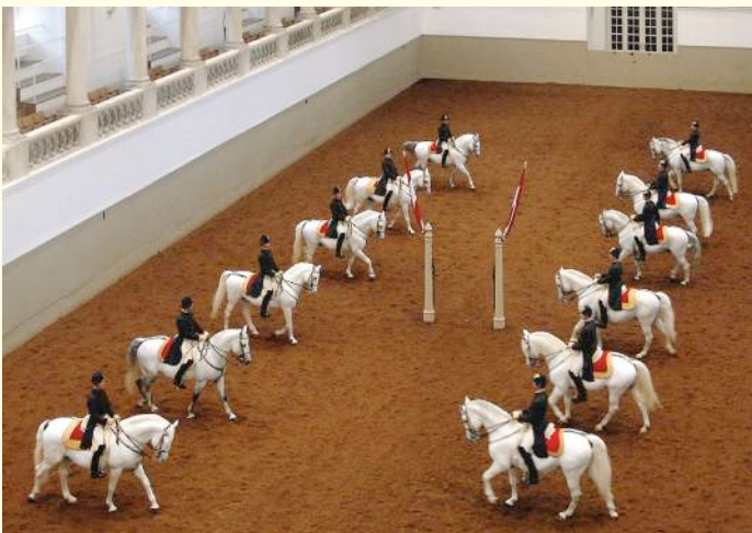
Lipizzaner stallions, Vienna

PRELUDE RATE $1,790 per person. Single supplement $465. Includes three nights at Steigenberger Hotel Herrenhof, Vienna; breakfast daily, two lunches, and one dinner; sightseeing as noted.