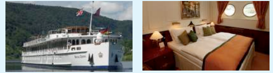
M.S. Royal Crown (left) and Premium Suite (right)

Refurbished in 2010, the intimate Royal Crown offers a 1930s-inspired Art Deco style and a comfortable, relaxed atmosphere. Specially designed for cruising the rivers of Europe, Royal Crown has a spacious sun deck and a lounge with panoramic views. Suites on Select Deck have portholes, and the Royal Suites on Panorama Deck have large windows. All 45 suites feature rosewood wardrobes, satellite TV and radio, a safety deposit box, individually controlled air conditioning, and bathrooms with shower. Onboard amenities include a library with daily newspapers, wi-fi throughout the ship, boutique, fitness area, sauna with shower facilities, and a restaurant with open seating.