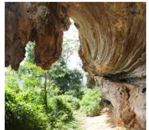
Topes de Collantes, Trinidad