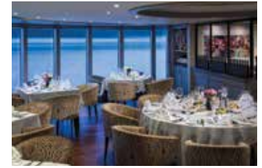
Chef's Table restaurant