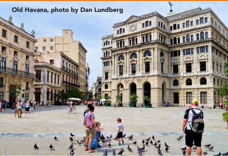
Old Havana