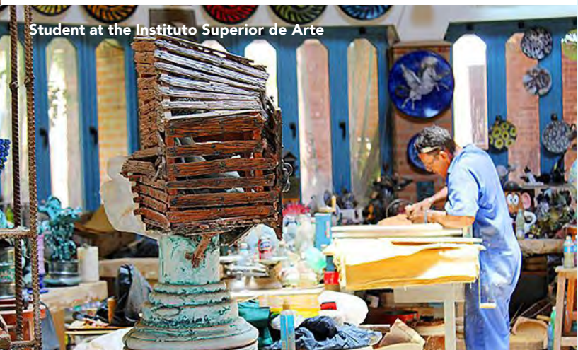
Student at the Instituto Superior de Arte

DISCLAIMER: The itinerary is subject to change at the discretion of Arrangements Abroad. For complete details, please carefully read the terms and conditions at www.arrangementsabroad.com/terms