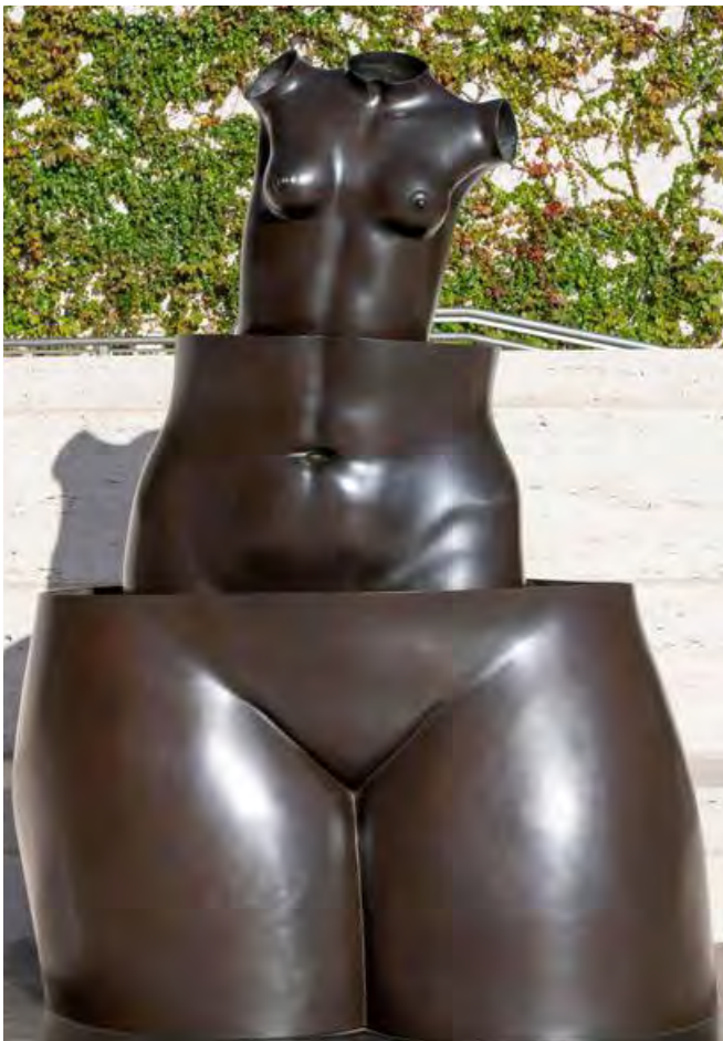
René Magritte, La Folie Des Grandeurs (Delusions of Grandeur) , 1967, The J. Paul Getty Museum, Los Angeles