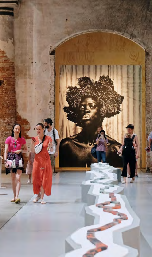
May You Live In Interesting Times, 59th Venice Biennale, 2019