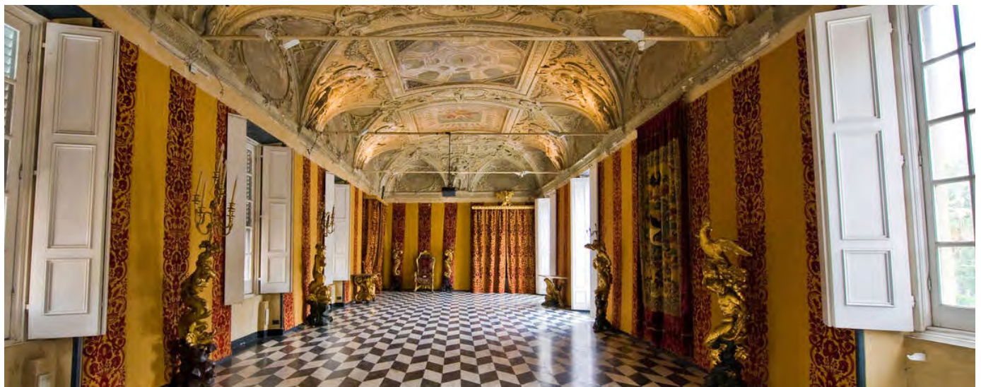
Photos (clockwise from top right): Sea Cloud II off the coast of St. Lucia; Villa del Principe, Genoa, Italy; and the Walker Art Center, Minneapolis