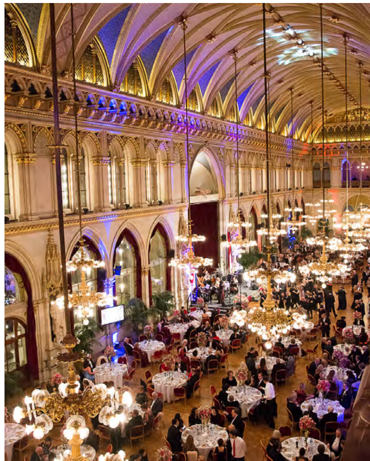
New Year's Eve Gala Dinner in the grand ballroom of the Vienna City Hall

Land / Rail Rates: From $17,999 per person, double rate