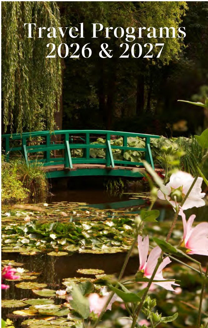
Monet's Garden, Giverny