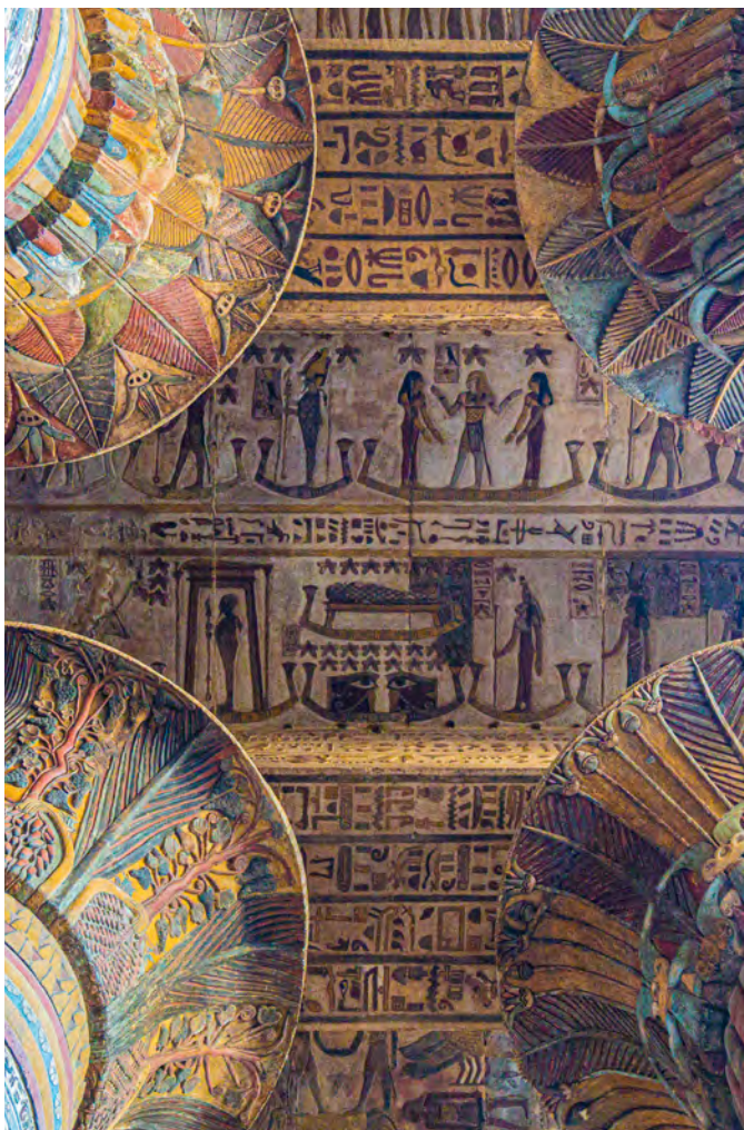
Ancient temple of Kom Ombo, Egypt

Celebrating 450 Years of Rubens: Belgium & Holland Aboard Magnifique III May 16 to 25, 2027 Land / Cruise Rates From $9,999 per person, double rate