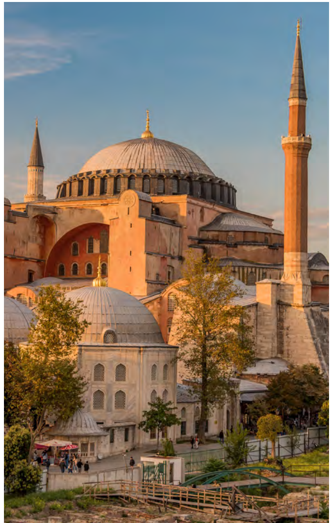
Hagia Sofia, Istanbul, Turkey