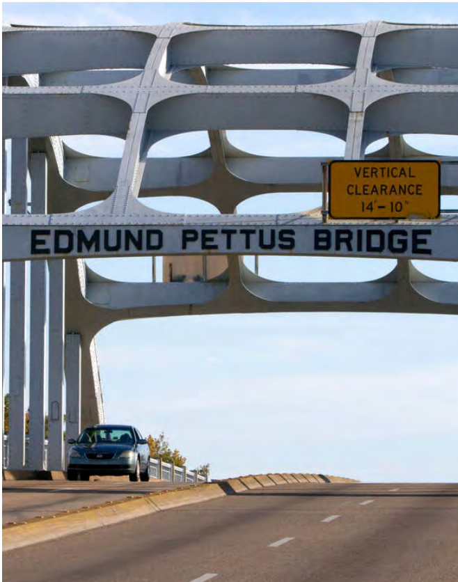
Edmund Pettus Bridge, Selma, Alabama

Land Rate: $10,999 per person, double rate