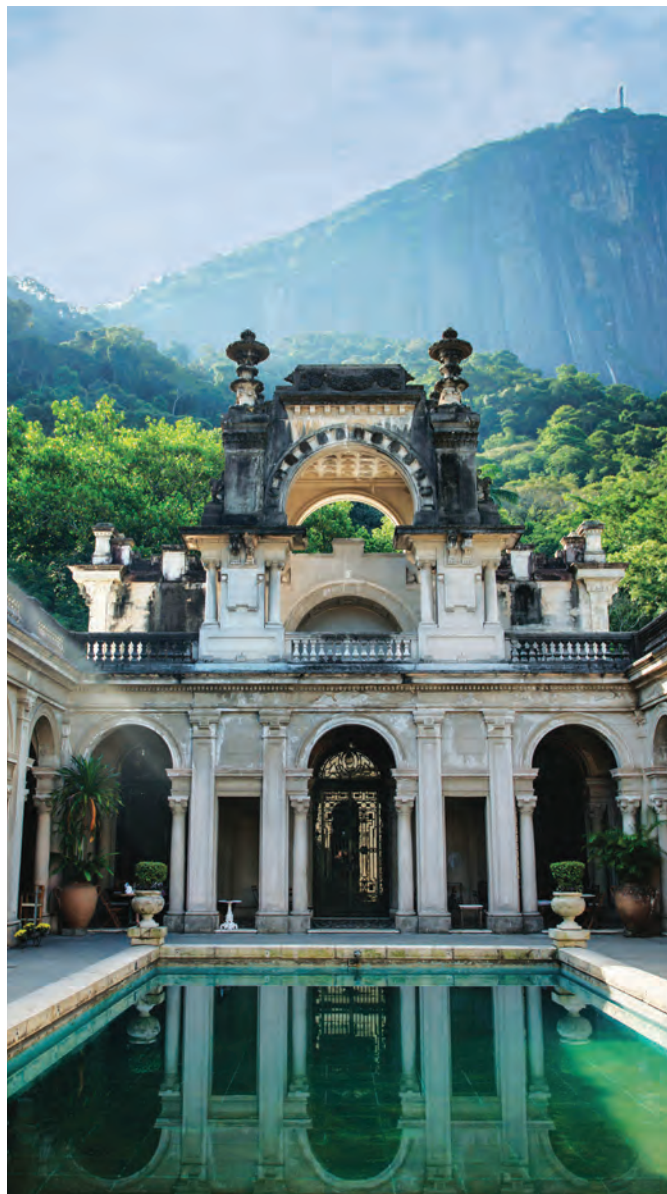
Parque Lage, Rio de Janeiro, Brazil